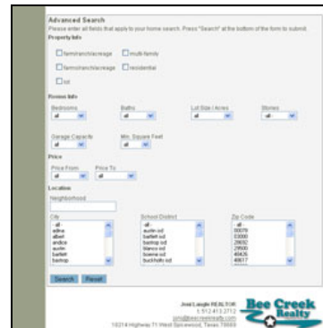
Advanced Search... You define and we build!